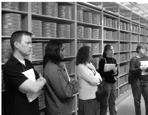
NYU Moving Image Archiving and Preservation graduate students visit the National Archives and Records Administration in 2005.